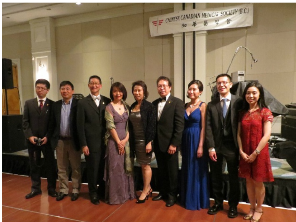
*2014 CCMS Board Members