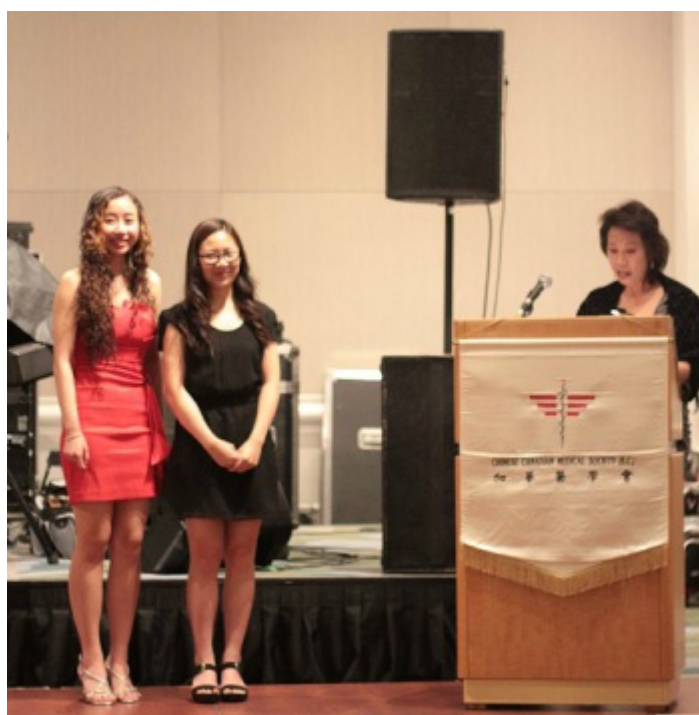
* Scholarship recipients